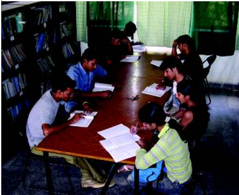
Well equipped library for students