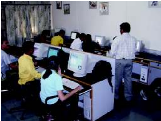
Students working in the Computer Laboratory