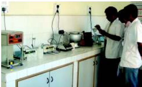
Students in the Chemistry Laboratory